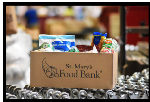
Day 2 Food is inspected, sorted, packed, and allocated.