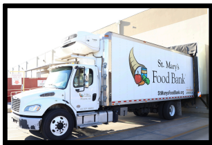
Day 1 Donations are received at St. Mary's Food Bank.