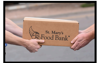
Day 4 Food is distributed to hungry individuals and families.